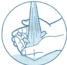
Step 2 – Wash your hands thoroughly with soap and water.