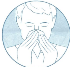
Step 1 – Blow your nose gently before using the spray.