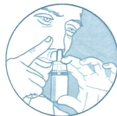
Step 4 - Gently insert the bottle tip just into one nostril. Press on the other side of your nose with one finger to close off the other nostril and pump one spray into the nose. Repeat in the other nostril. Repeat in each nostril for a total of 4 sprays (2 in each nostril). Inhale gently through the nose while applying but do not inhale deeply.