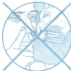
ENSURE SPRAYER IS HELD VERTICALLY.